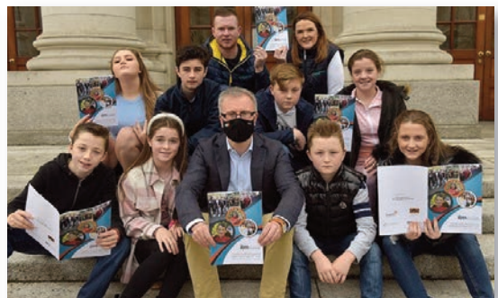
Launch of ITM Traveller Youth Participation and Leadership Strategy