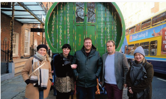
National Traveller Mental Health Network Protest, December 21

NTWF is an alliance of Traveller women and Traveller organisations throughout Ireland and aims to work collectively to challenge the