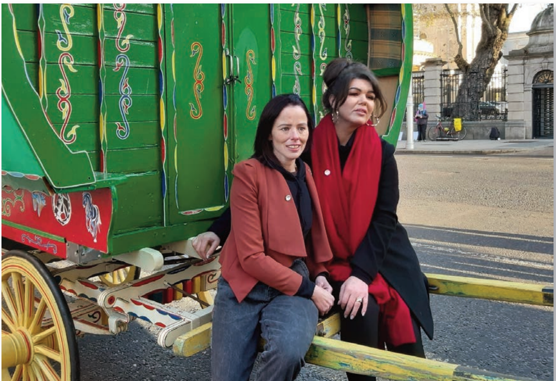
National Traveller Mental Health Network Protest, December 21

We were represented on the CIB digital strategy working group in 2020. We came together with the other 20 CIB funded companies as part of an information gathering, consultation and discovery project, to provide the foundations for the formulation of a CIB Digital Strategy for the funded services. We sat on the digital engagement subgroup and were pleased to submit the final report with appropriate recommendations to the Strategy and Governance Committee for their consideration. We were also pleased to take part in the client journey mapping exercise as part of this report to highlight the unique journey Traveller clients undertake when engaging with MABS services.