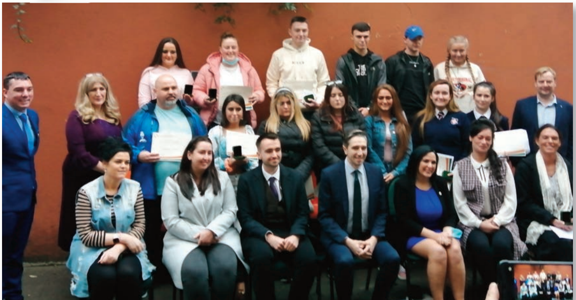
Exchange House, Ed awards