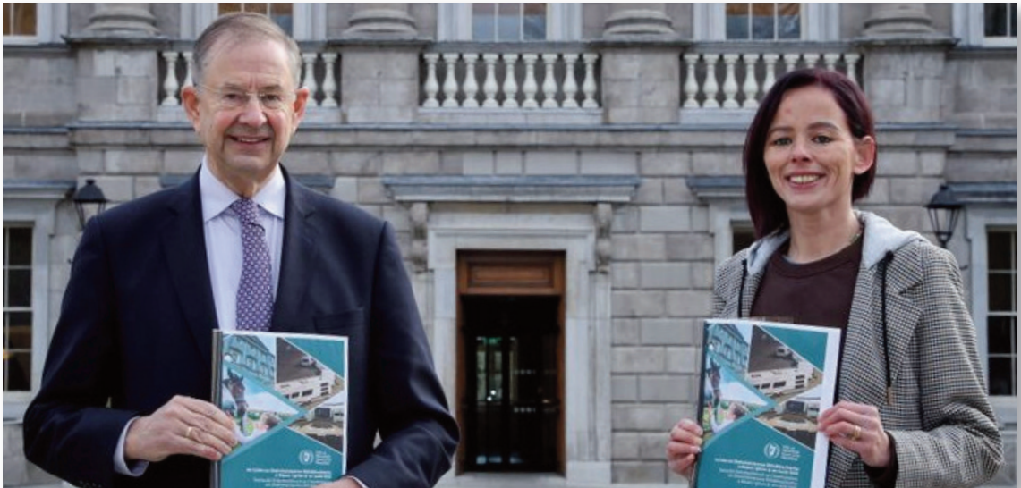
Launch of the Joint Committee on Key Issues Affecting the Traveller Community Senator Eileen Flynn Senator Eamon O Cuiv

The following submissions were made in 2021: